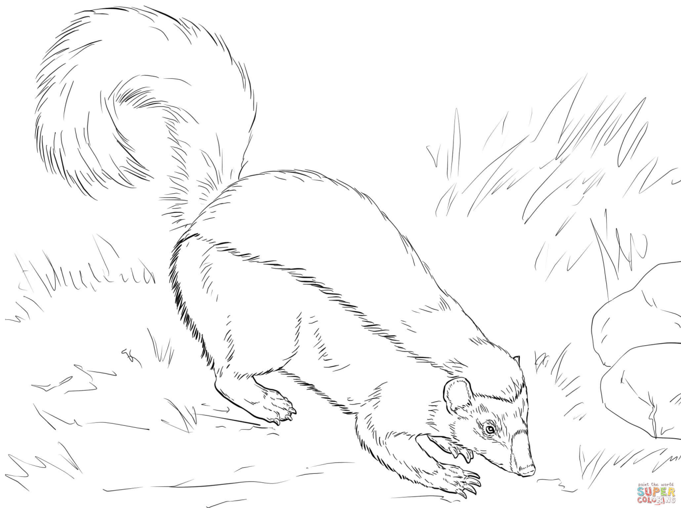
Hog Nosed Skunk